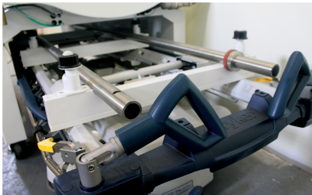
PATENTED* GURNEY UNDERCARRIAGE STORAGE